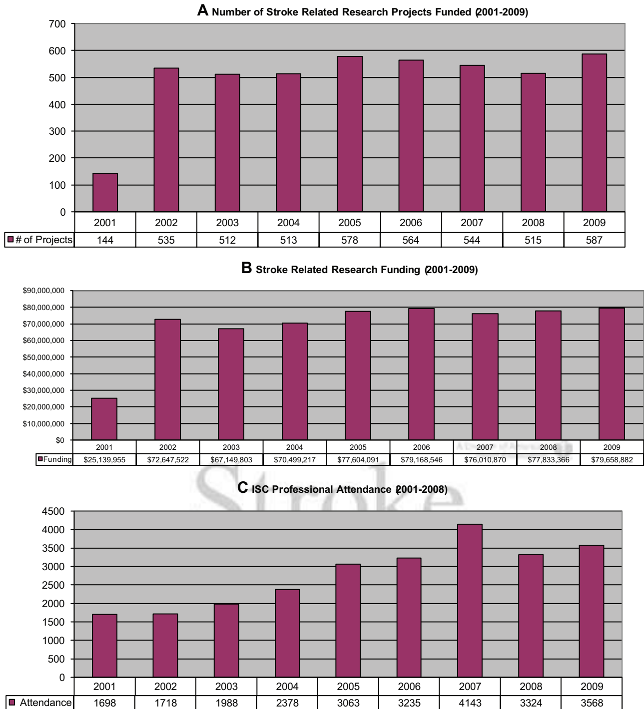
Figure 1. Temporal trends in stroke-related research projects, research funding, and International Stroke Conference (ISC) attendance.